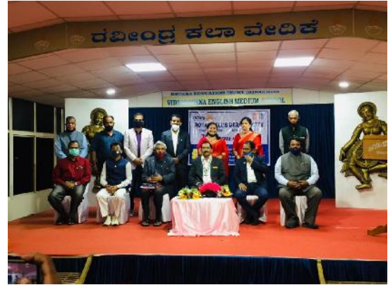
Installation Ceremony -2020-21